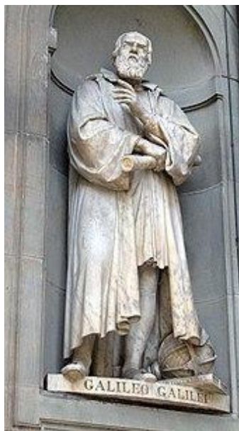
Figure 3: Statue outside the Uffizi, Florence